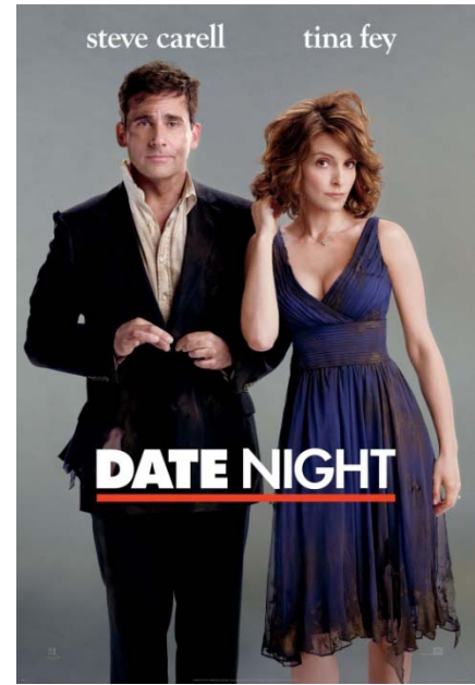
Opening Night Film, Date Night