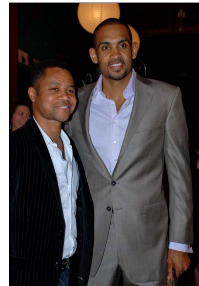
Cuba Gooding Jr. & Grant Hill Opening Night 2011

Support of this effort results in a superior return on investment for our partners. From community-building to exposure through a comprehensive advertising and publicity campaign generating nearly $515,000 in media promotion.